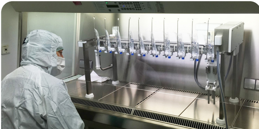
Automated preparation of personalised cytostatic medication